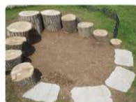
Goat play area...