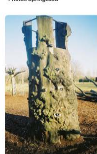
Valbyparken climbing logs Copenhagen