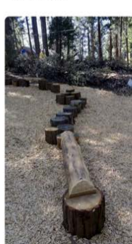
Things to Consider before Making Kids Playground...