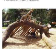
Blue Lake Park: The Coolest Place to Dig, Splash...