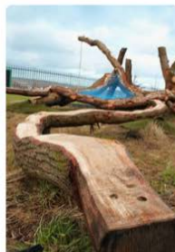
Playground Benches - Foter