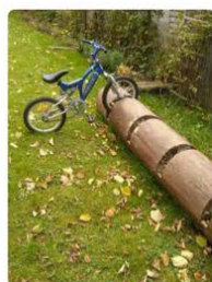
Furniture With Free Delivery

2) Move it to the now unused 'picnic area' where it could be a climbing feature and part of a wider natural adventure play area. This is my preferred option as this space is neglected at present. This is also a different kind of play from the park play equipment and may not appeal to everyone. Do we have any issues moving the trunk and other logs to this location? Being quite natural, rough and ready, could this work be undertaken by volunteers?